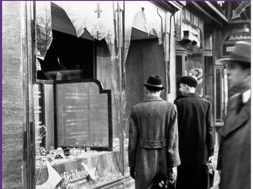
Jewish shops and businesses were destroyed during The Night of Broken Glass in 1938

In 1933 the Nazis came to power in Germany, and life became increasingly difficult for German Jews. Anti-Jewish legislation was passed, which denied Jews many freedoms and restricted their rights, starting with removing them from certain professions and schools and universities. The Nuremberg Laws in 1935 restricted who Jews could marry, and went further than that: they defined anyone who had three or four Jewish grandparents as a Jew, regardless of whether or not that person saw themselves as Jewish. Thus the Nuremberg laws took away people's freedom of religion and freedom to self-identify. On 9 November 1938, Jewish shops and businesses in Nazi territories were attacked and destroyed. The night became known as The Night of Broken Glass. Jewish people were banned from cinemas, theatres and sports facilities.