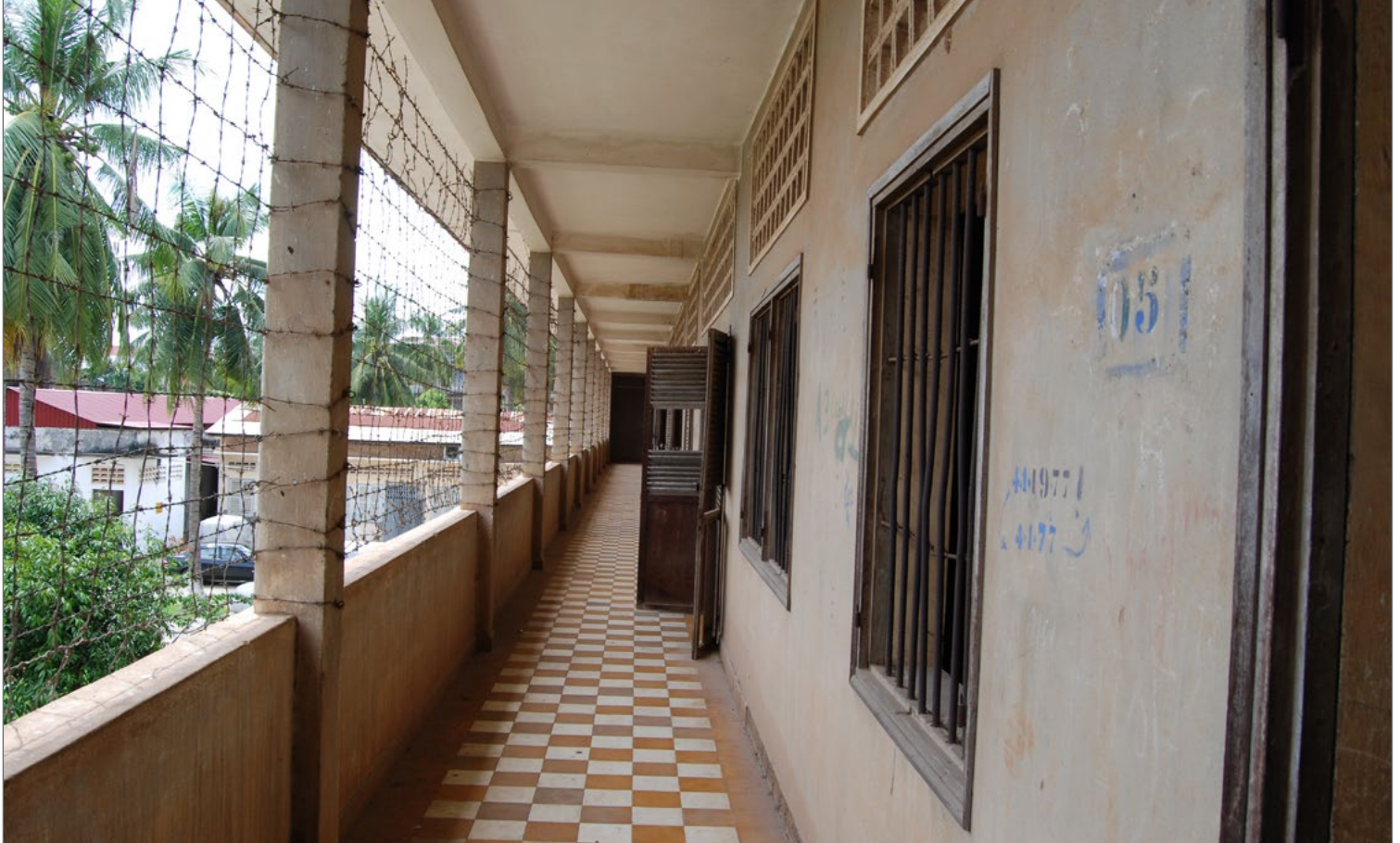
S-21 prison, Phnom Penh

Learning from genocide - for a better future