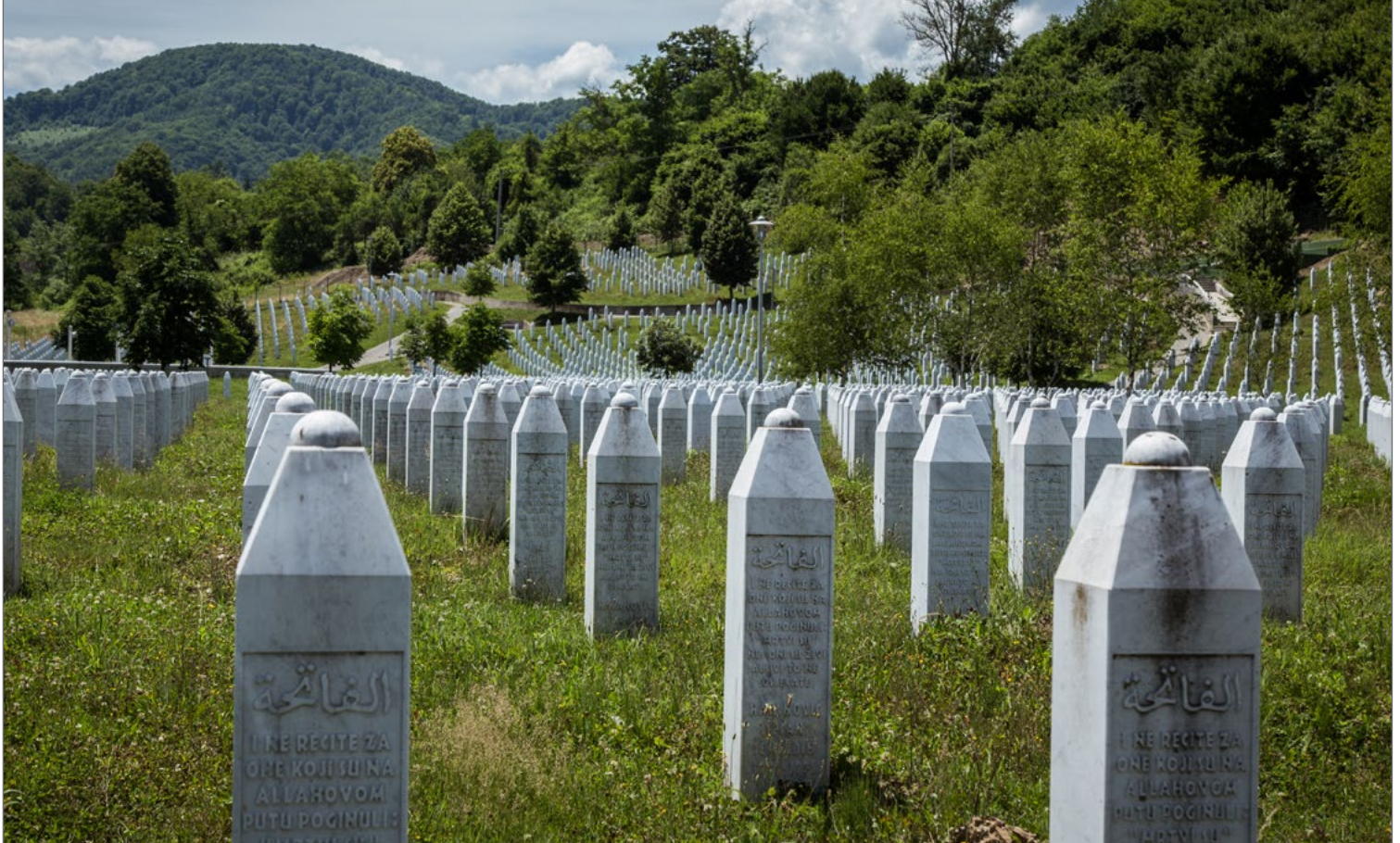
Srebrenica Memorial

Learning from genocide - for a better future