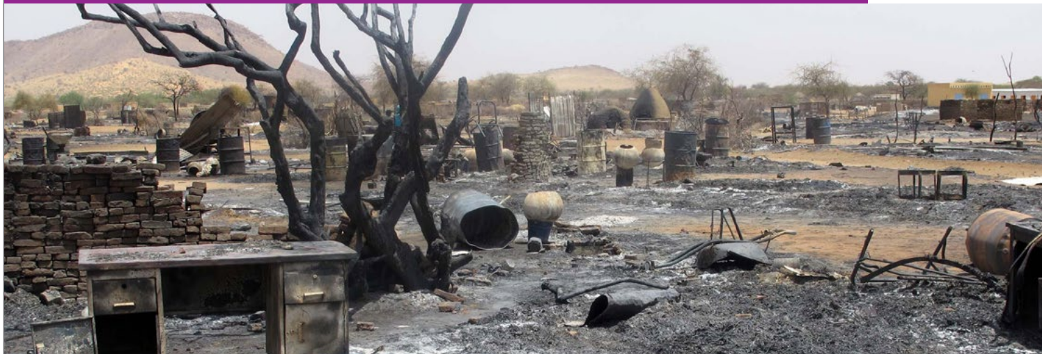
A camp for internally displaced people in Darfur, after it was attacked

Learning from genocide - for a better future