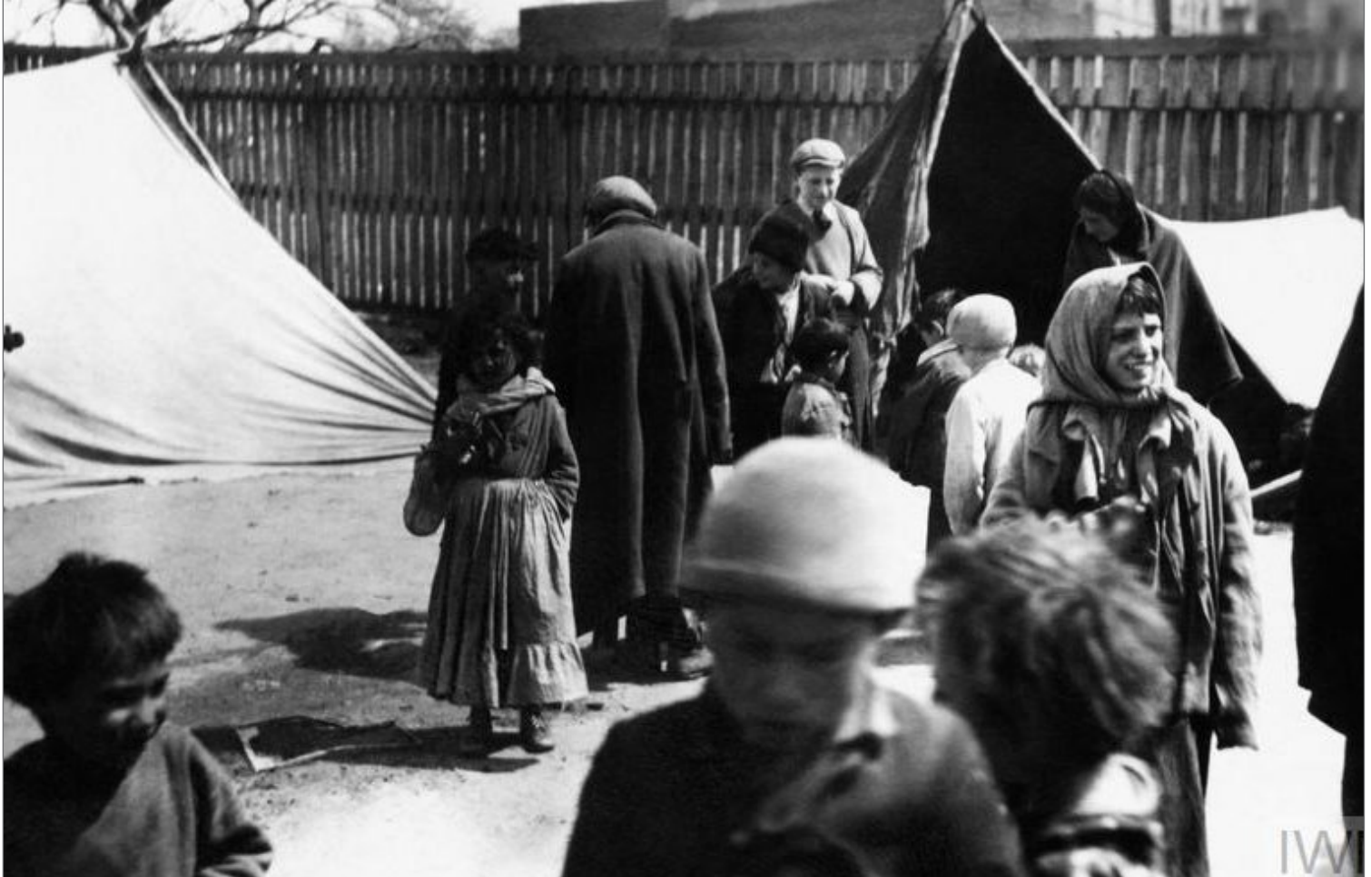
Roma and Sinti people held at a camp in central Poland

Learning from genocide - for a better future