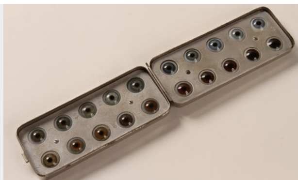
Eye colour chart used by the Nazis