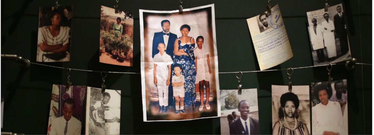
Photos of victims inside Kigali Genocide Memorial Centre

Learning from genocide - for a better future