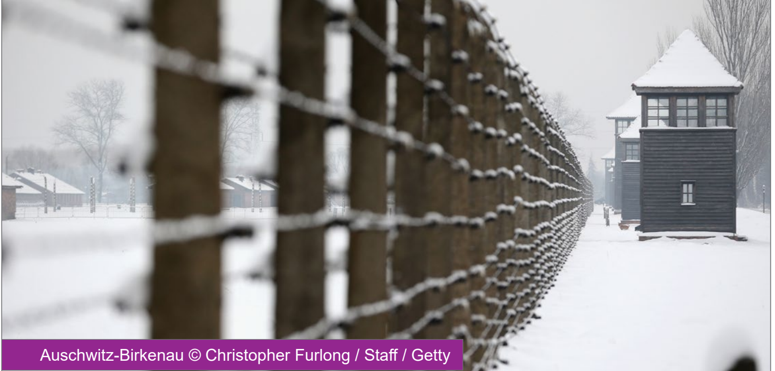
Auschwitz-Birkenau

Learning from genocide - for a better future